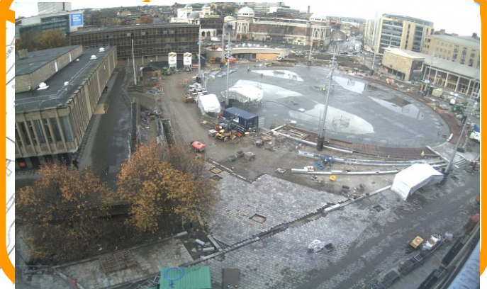
Current site activity Web cam view - 7 November 2011