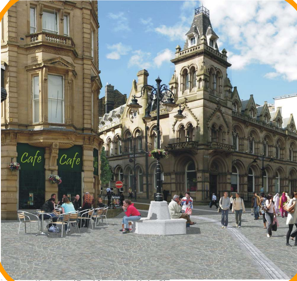
Hustlergate / Tyrrel Street - New Market Place