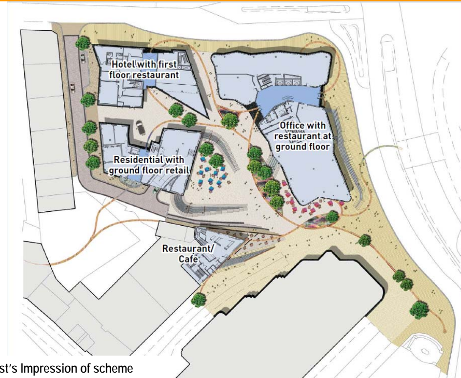
Artist's Impression of scheme