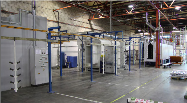
The new powder coating plant in Steeton

In 2008, Acorn acquired Bison Bede Stairlifts and in 2009 the company fully integrated the production of stairlift models which operate on non-standard and curved staircases. This has resulted in an expansion of their Steeton factory with the introduction of a new production line including a fully automated powder coating plant. This investment has resulted in the creation of 85 new jobs including CAD technicians, skilled machine operators and production operatives.